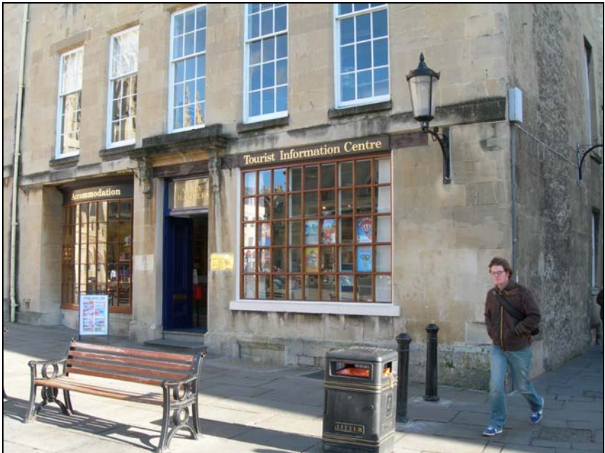
TOURIST INFORMATION CENTRE

Throughout the hunt you will see extra information marked with a treasure map. Whilst this does not form part of the instructions it is intended to make your journey more interesting. Any detours you make to explore the surrounding sights en route should be retraced before continuing the hunt where you left off.