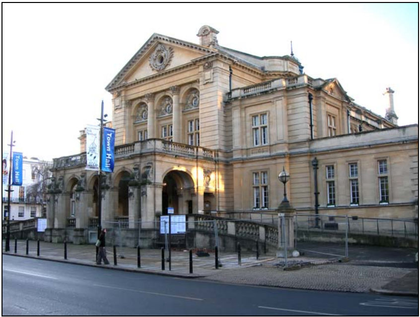
THE PUMP ROOM